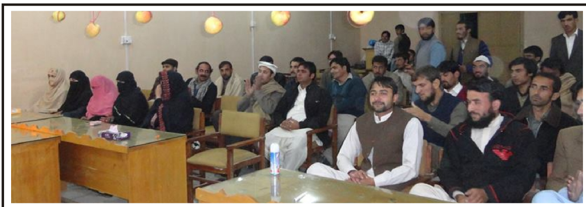
Annual Dinner at the Department of Chemistry, SBBU on December 3, 2014